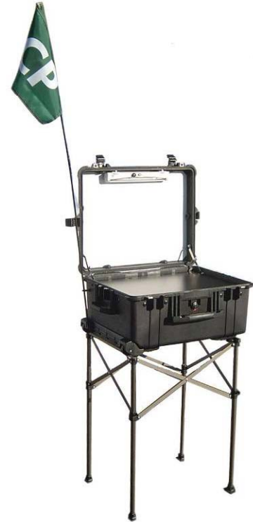
TACTICAL COMMAND WORKSHEET | LARGE SCALE INCIDENT